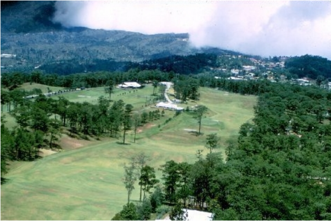
2. #6 &7 Fairways, Trailers, Halfway House, Baguio City in the Background