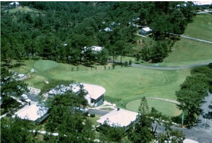
11. #18 Fairway & Green plus the 19th Tee Club House