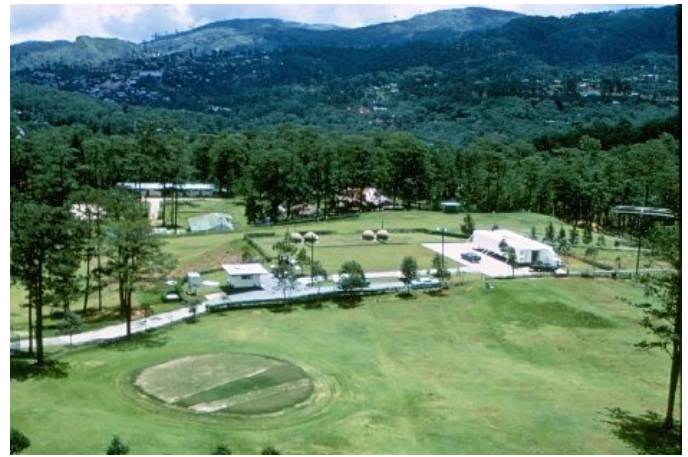
5. #8 Tee, Trailers, Frank Golfing in the Background on #7 Tee