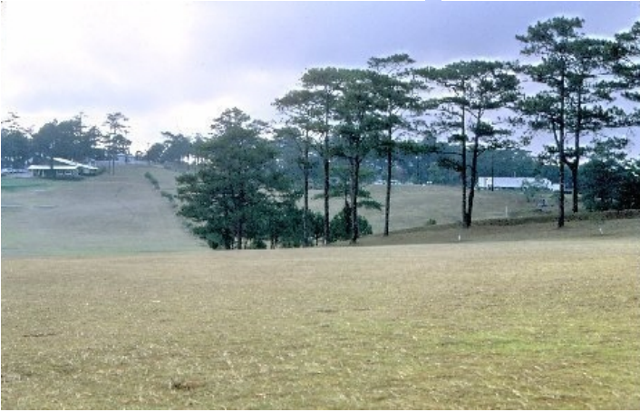
8. #9 Fairway with the Halfway House in the Background and the Trailers on the Right