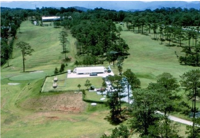
6. #6 Fairway on the Left with the Mile-High Club/Bowling Alley in the Background, Trailers, and #8 Fairway on the Right