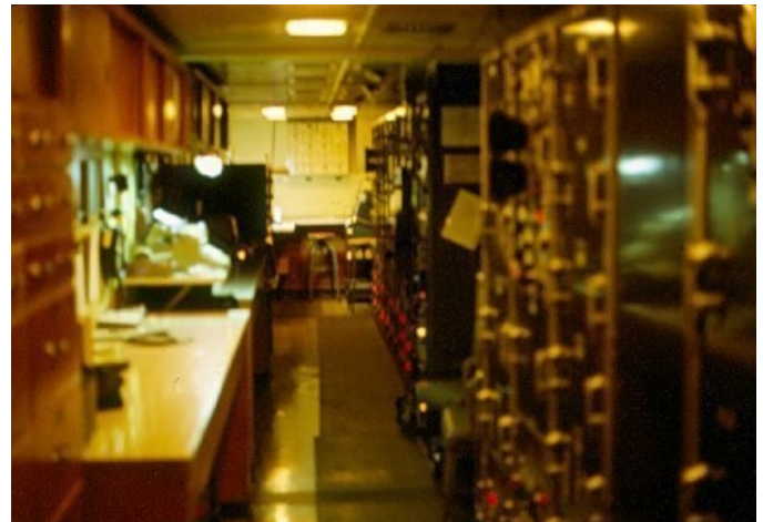
7. Q4 Equipment inside the Trailers