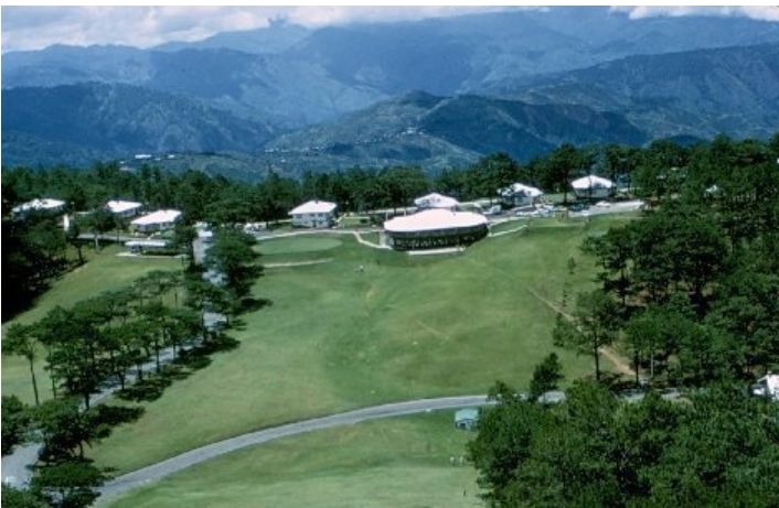
10. #18 Green and the 19th Tee Club House