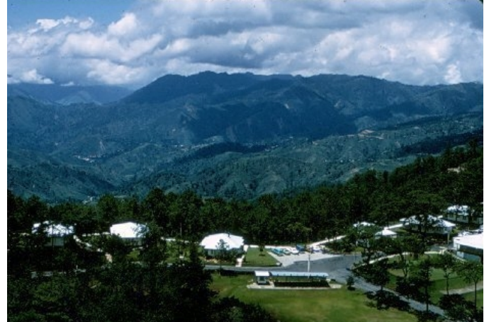
9. Golf Driving Range and Housing