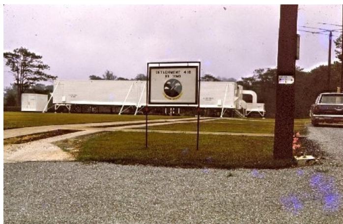
1. Det 418 Q Technique Operations Trailers

(Continued on page 11, and 12)