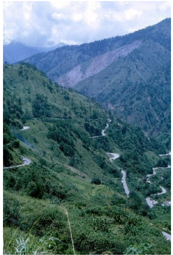
12. The Main Road Down the Mountain