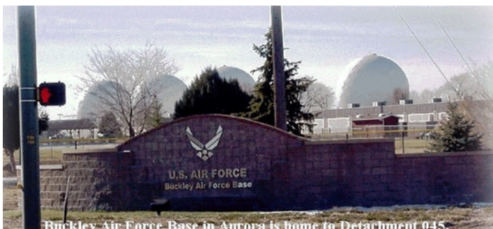
Buckley Air Force Base in Aurora is home to Detachment 045.