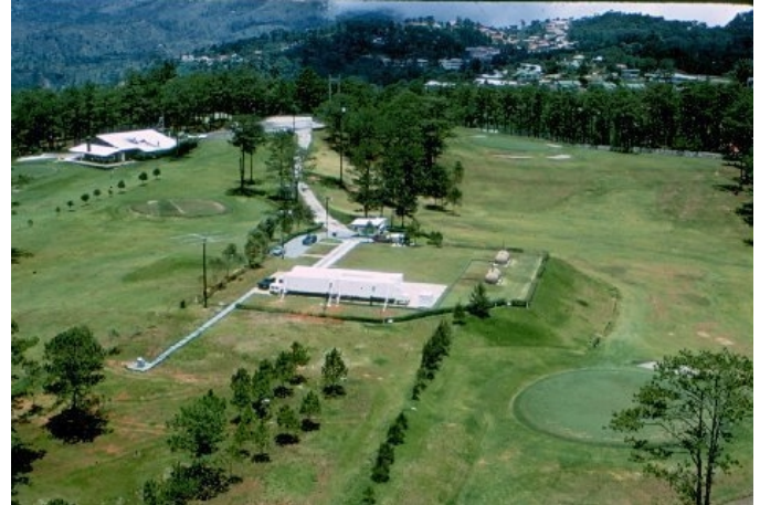
3. #6 Green, #7 Fairway, Trailers, #8 Tees, and Halfway House.