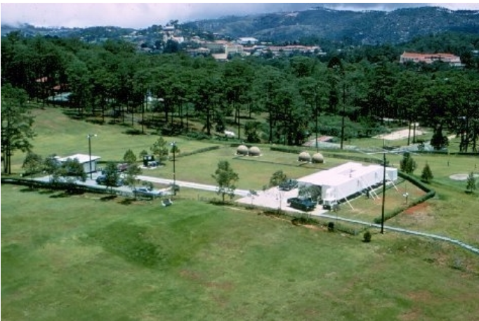
4. #8 Ladies' Tee, Trailers, Frank Golfing in the Background